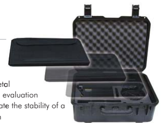
Tool Kit stows inside the ORION case for transport